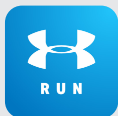
Map My Run by Under Armour

Your registration includes a free online mileage log to tally your miles. Use your LOG IN LINK to access your Challenge and begin logging miles. FORGOT YOUR LINK? Go to Sign Up, enter your email, and click “RESEND MY LINK.” You'll receive your link via email right away.) Use your own fitness app or GPS-based bike computer to calculate your miles on the waterway and Canalway Trail. There are several good apps that use GPS-based tracking systems to record your route, distance, speed, and more.