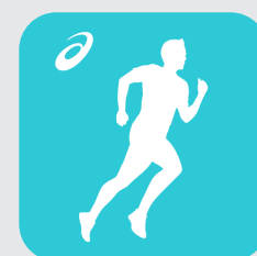
Runkeeper — Distance Run Tracker