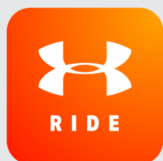
Map My Ride by Under Armour